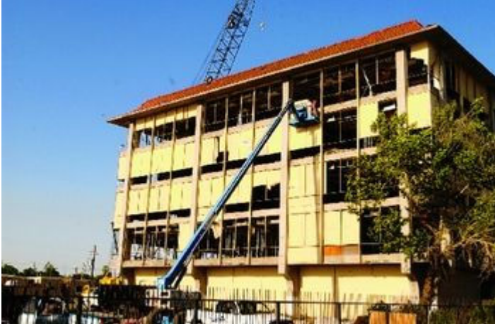
Marina Tower was demolished in May 2004. The land where it once stood is now used as a parking lot for Stockton Ballpark.